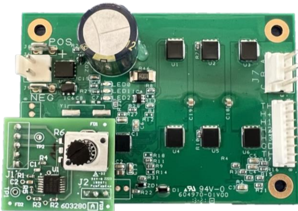
Figure 3 – Parent board ZB603288W with ZZ603287 connected