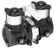
2110ZA26/12M Magnesium Die Cast Components