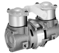
2110ZA26/12 Aluminum Die Cast Components