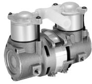
2110ZA26/12 Aluminum Die Cast Components