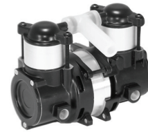
2110ZA26/12M Magnesium Die Cast Components